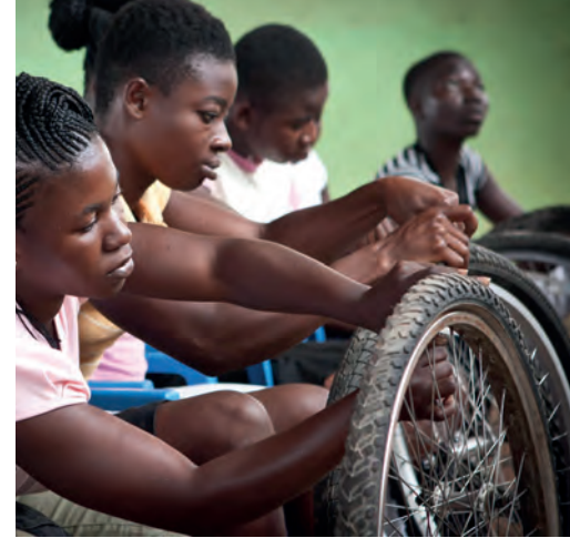
Re-Cycle has sent more than 160,000 bikes to Africa, where they transform lives