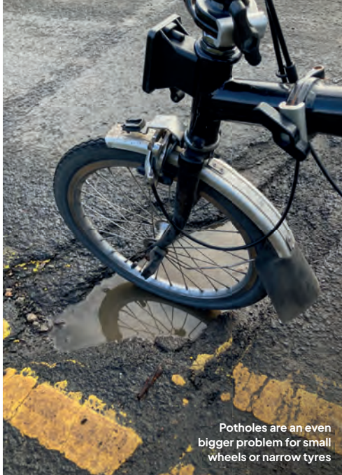
Potholes are an even bigger problem for small wheels or narrow tyres

However, with support from Cycle SOS and specialist cycling lawyers at Fletchers Solicitors, the member was able to challenge this. A local resident confirmed that multiple online reports about the potholes had been submitted in the weeks before the incident