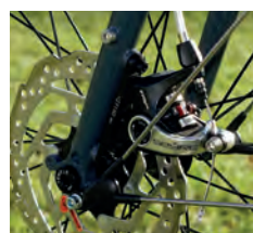
Top: Triple chainset gives a good range with small steps Bottom: Flat-mount cable discs are effective and easy to fettle

tape and saddle, and a silver bar, stem and chainset.