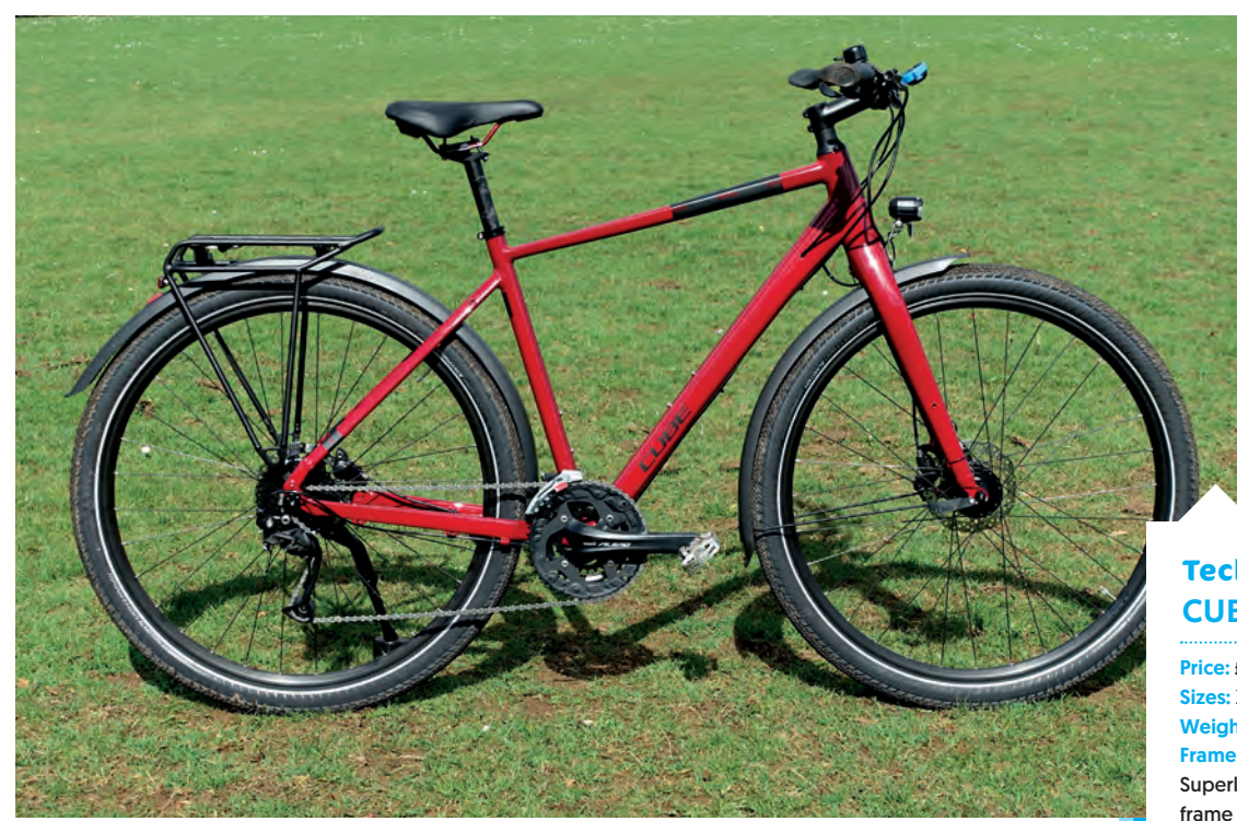
66 The Cube offers a regal ride: upright, comfortable and with great visibility