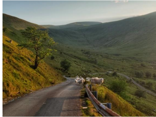
Looking back down the Elbow