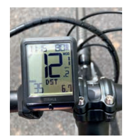
Above: The PulsarOne display shows assistance mode and charge remaining much more clearly than the iWoc controller

Mounting and dismounting is easy thanks to the low-step aluminium frame. If you needed it to be easier still, you could fit an externally-cabled dropper seatpost. The bottom bracket isn't too