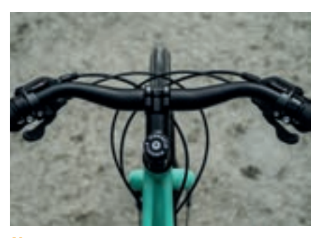
Above: A more backswept handlebar gives the Pinnacle a relaxed riding position that complements its wide tyres

Although the industry owes a huge boost in sales from affordable lightweight aluminium bicycles coming onto the market in the 1980s, I'd describe the ride characteristics of aluminium as rather unforgiving and almost 'jarring'. What's noteworthy about the Chromium 3 is its wheel and tyre combination. The 47mm-section herringbone file tread tyre on a 650B wide rim does a great job of dissolving this 'harshness' – particularly important with a straight bladed fork. Recommended tyre pressure is 45-65psi. I ran the tyres at 55psi and was pleasantly surprised by the heady mix of