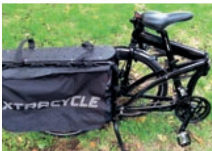
Above: It's no Brompton, but it should fit in a hallway or big car boot and even pass as a solo bike on trains

My mum (age 70) described the folding mechanism as making 'the satisfying clunk of an expensive car'. Her slightly arthritic fingers also had no problem pulling back the chunky, user-friendly levers for the hinges.