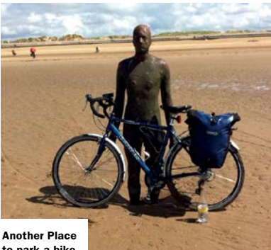
Another Place to park a bike

Some Trans Pennine Trail volunteers from Hull guided us through their city, showing us the preparations for Hull City of Culture on the way. Thanks, guys! We finished at Hornsea, where I've never had better fish and chips.