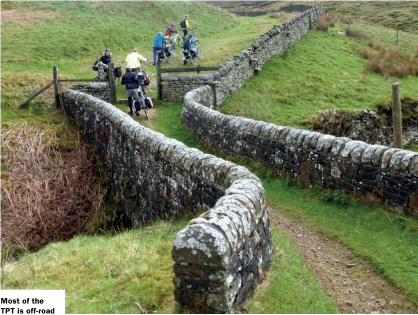
Most of the TPT is off-road