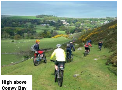
High above Conwy Bay

So why had I decided to join this fixed-base holiday? It's an amazing feeling to do something that frightens you, heightens your senses, and brings you back to nature. Then there's that feeling of being 12 years old again and having that freedom that only two wheels can bring.