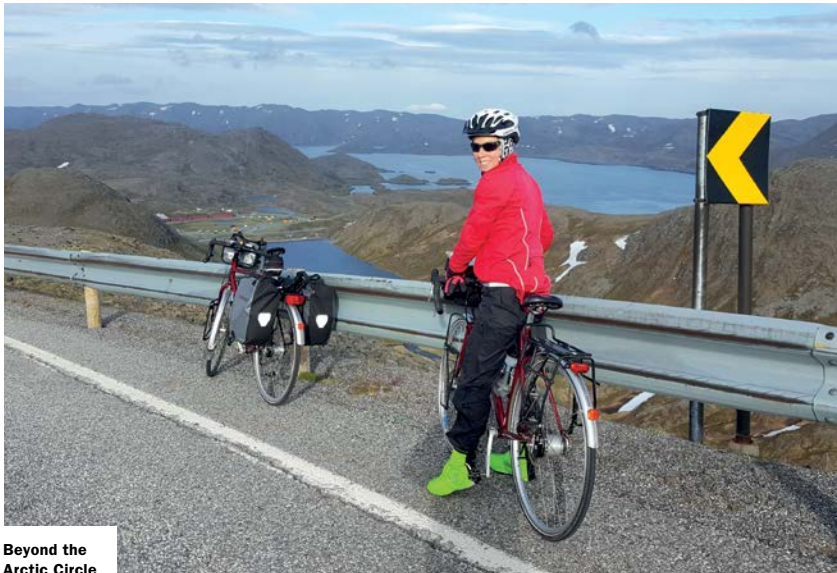
Beyond the Arctic Circle