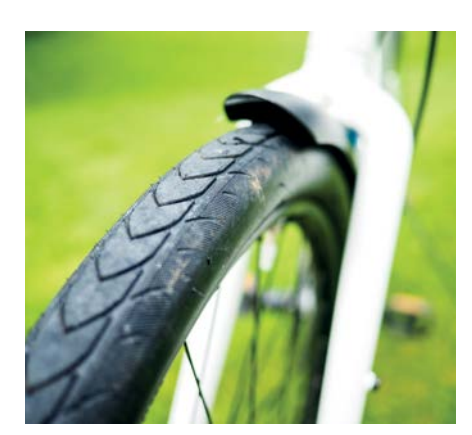
Mudguard room is fine despite the tyre volume. as 650B×47 is about the same diameter as 700×28

Frame and fork are aluminium. A diamondshaped frame is available but Sarah chose the mixte version for easy mounting and dismounting, especially with a rear child seat fitted. The tall head-tube and swept back handlebars gave her the relaxed, semi-upright