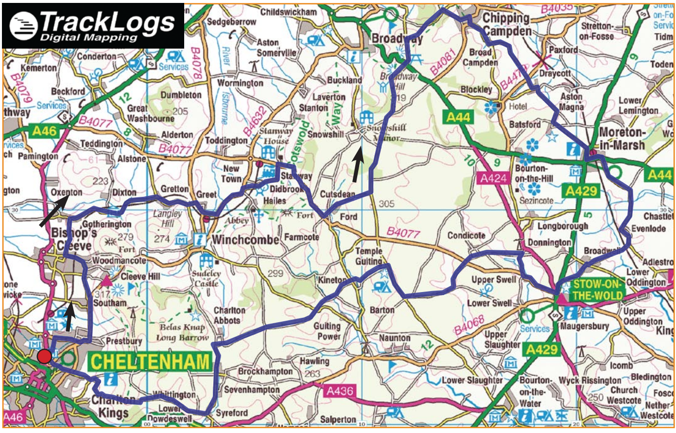
Ordnance Survey mapping © Crown copyright AM40/07. Created using TrackLogs Digital Mapping software, www.tracklogs.co.uk