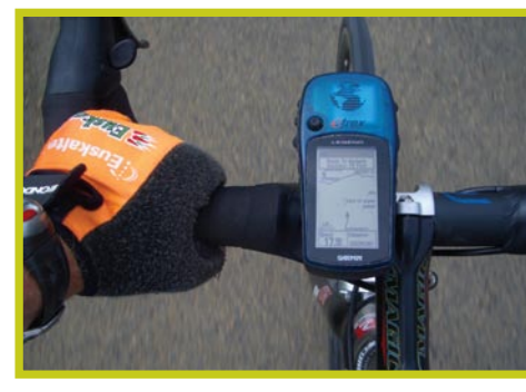
GPS is handy and lightweight, but you'll need to take a charger with you when touring

The high-tech strategy cuts the number of gadgets by choosing one that does several jobs. You can now get phones with PDA functionality, that play music, incorporate okay cameras (fine for snapshots) and even GPS. The low tech strategy declares a curse on