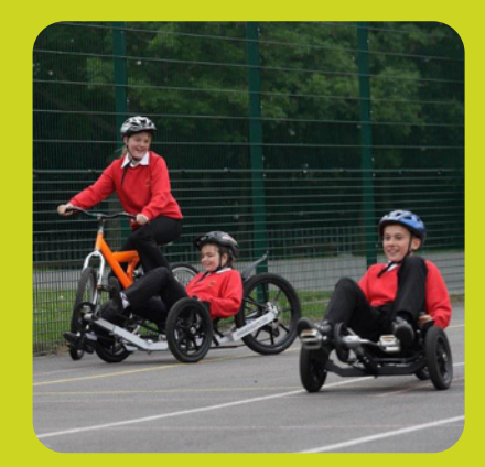
Schools Cycle Training