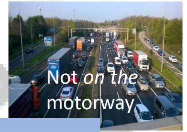
Not on the motorway