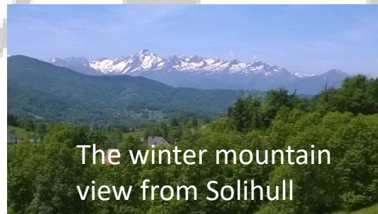
The winter mountain view from Solihull