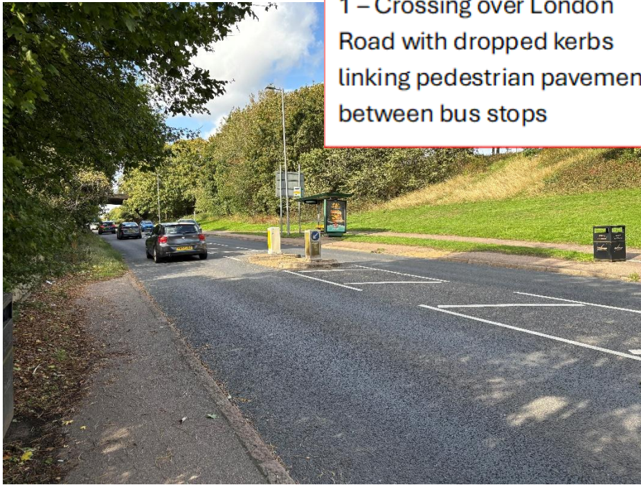
1 – Crossing over London Road with dropped kerbs linking pedestrian pavements between bus stops