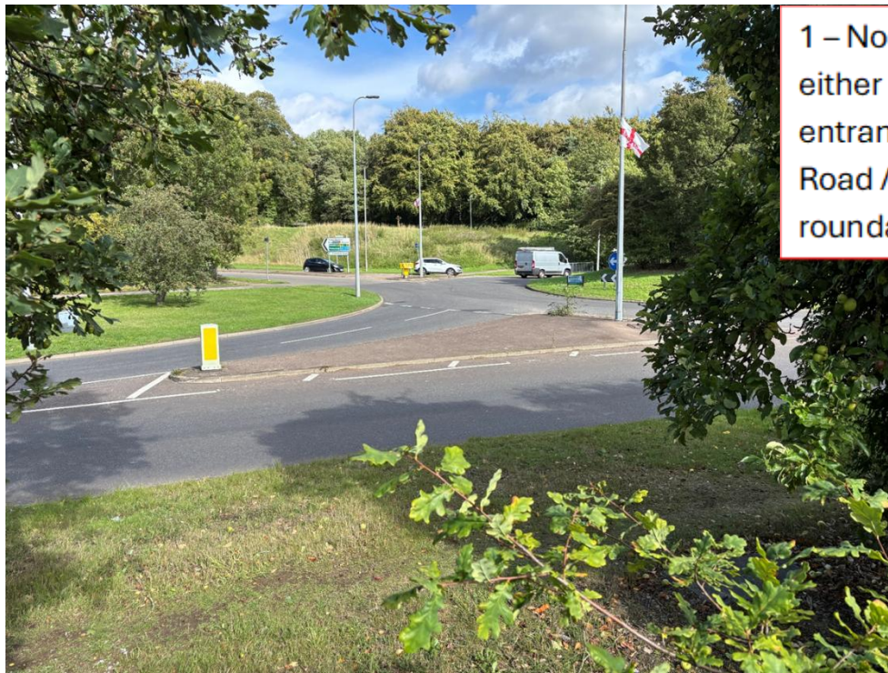
1 – No pavement on either side of the road entrance off the London Road / Monkswood Way roundabout