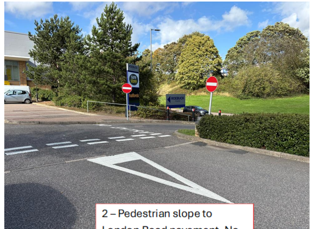
2 – Pedestrian slope to London Road pavement. No dropped kerb at carpark end.