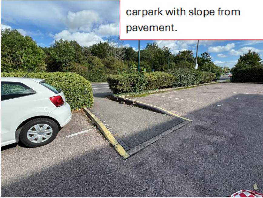
5 – Pedestrian entrance to carpark with slope from pavement.