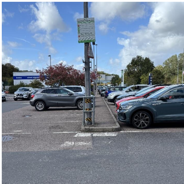
2 – Pedestrian route joining carpark across entrance road without dropped kerbs