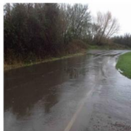
Flooding and drainage