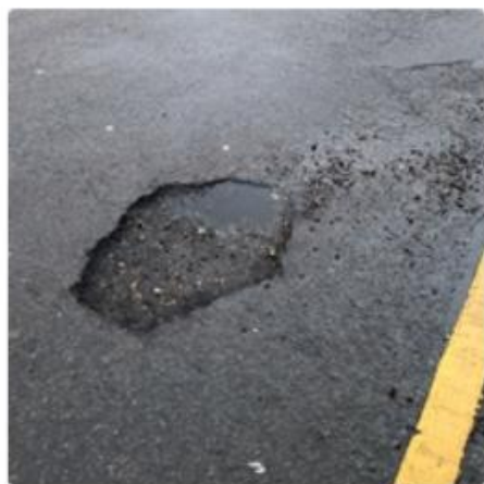
Road and cycle path faults (including potholes)

Have you ever reported problems with the cycleways in Stevenage to the Highways authority? This question excludes vegetation and cleaning but includes things such as: