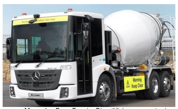
Mercedes-Benz Econic-DirectVision: cement mixer

react to their manoeuvres. Also, getting into and out of a low entry cab is safer and easier for drivers.